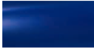
Clipper Blue (Special Point)