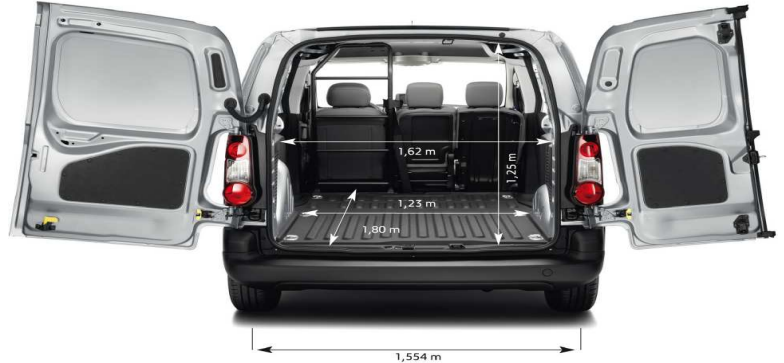
L1 Panel Van