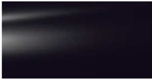
Black (Special Paint)